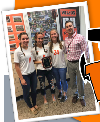
A special thanks to Ed Goodnight for many the great pictures!

Congratulations to all of the athletes, coaches, and teachers who made this possible.